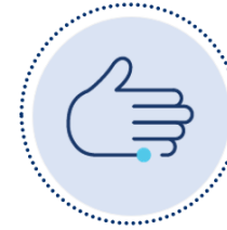
Numbness or tingling of hands or feet