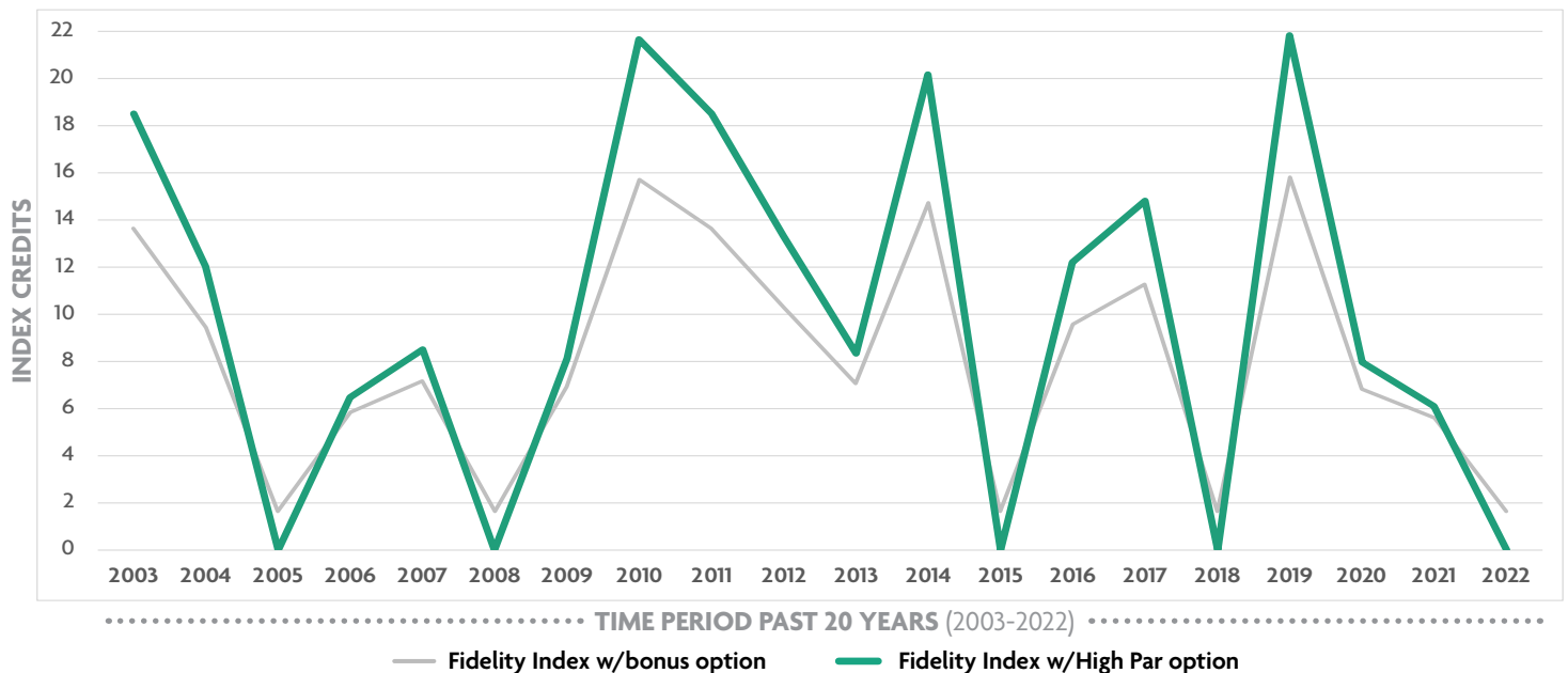
Exhibit 1: Comparing performance of different options on the Fidelity Multifactor Yield Index SM 5% ER

The crediting options on the Fidelity index we offer on our IUL products have individual strengths that can serve different purposes, depending on your client's financial goals. Over the past 20 years, if the high-par option had been available, the chart below depicts what the index credit would have looked like in comparison to the existing version of the Fidelity index on the Builder Plus IUL® 3 product, which contains an additional bonus 1 . When combined, each option can complement the other to create more balance when exposed to market volatility.