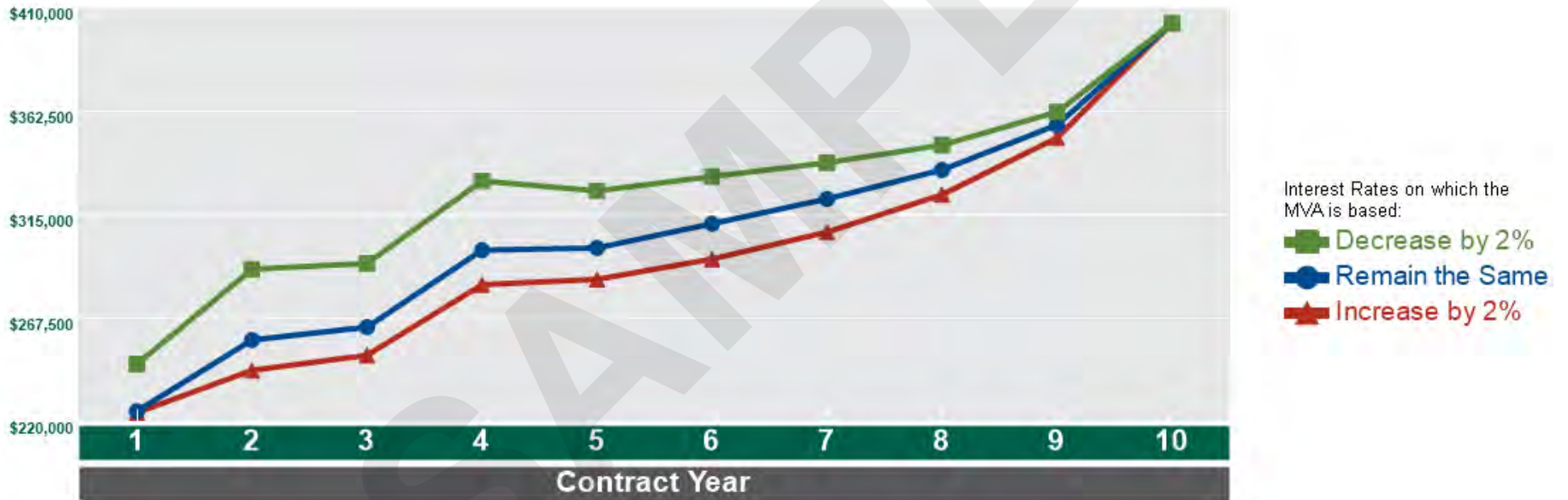
Hypothetical Surrender Values Reflecting MVA

The graph below shows the projected surrender value under sample MVA scenarios as described below during the surrender charge period of the Contract based on the initial premium amount and the assumption that there are no partial surrenders.