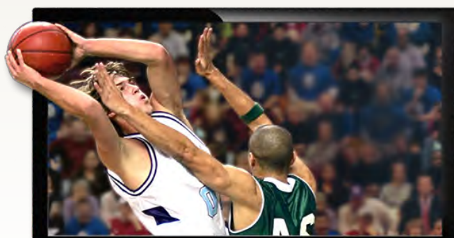
Flat Screen Smart-TV

FOUR Runners-Up will Receive a $50 Amazon Gift Card!